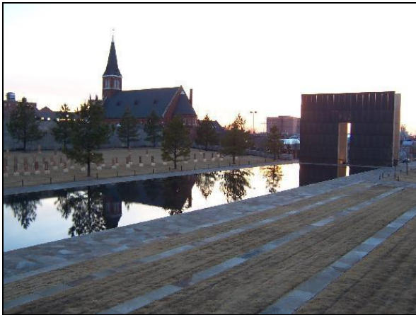
Oklahoma City National Memorial