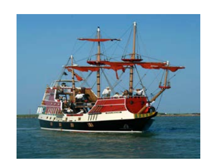
Black Dragon Pirate Ship