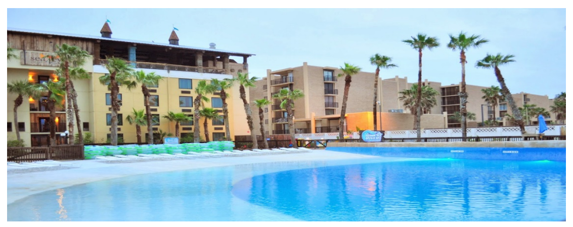
Schlitterbahn Waterpark & Resort